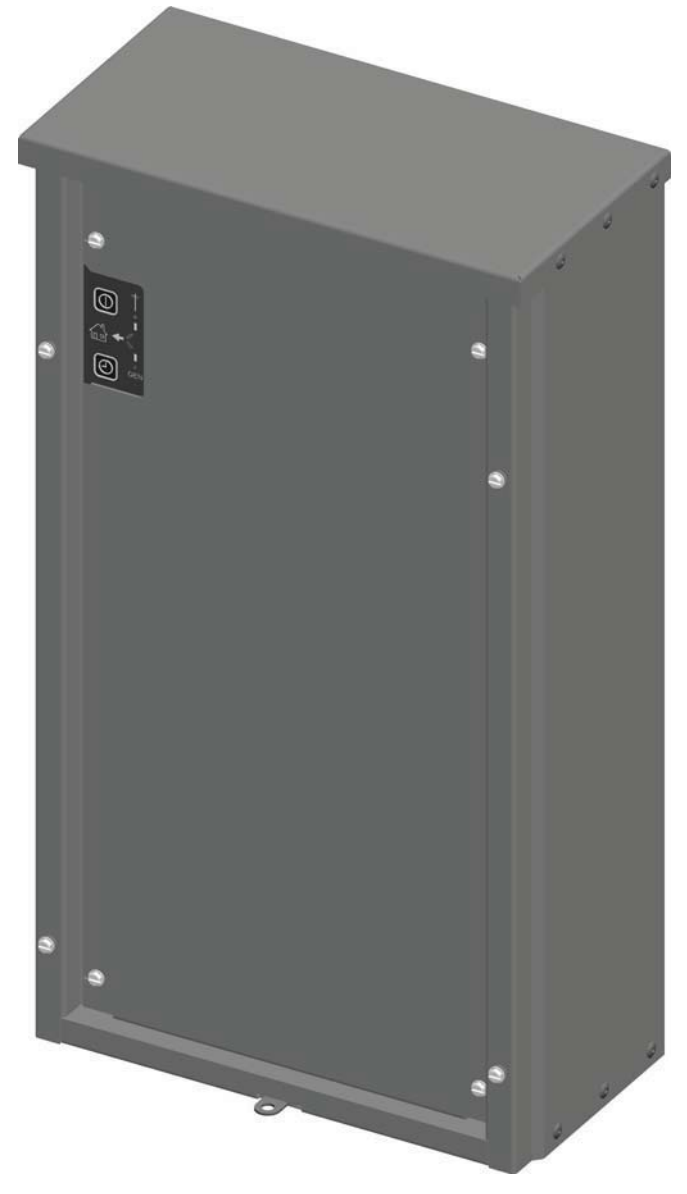
INNER PANEL SHOWN

NOTES: DIMENSIONS IN [ ] ARE INCHES. FINISH: ANSI 49 GRAY. REFER TO OPERATOR'S MANUAL PRIOR TO INSTALLATION AND OPERATION OF UNIT. APPROXIMATE WEIGHT: 7 Kg (15 LBS.)